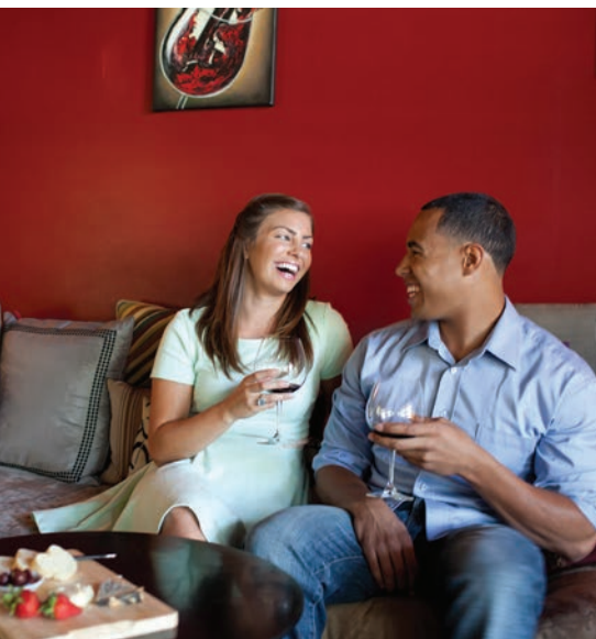
CLAREMONT VILLAGE, above; sampling the vintage at Packing House Wines, below.

AS HOME TO the seven private schools that make up the Claremont colleges, Claremont isn't exactly a well-kept secret, but Claremont itself, a city of 39,000 in the San Gabriel Mountains foothills 30 miles east of downtown Los Angeles, is a genuine hidden gem. It's an easy day trip from LA, but Claremont's diverse attractions and ideal balance of urban savvy and village atmosphere make lingering worthwhile.