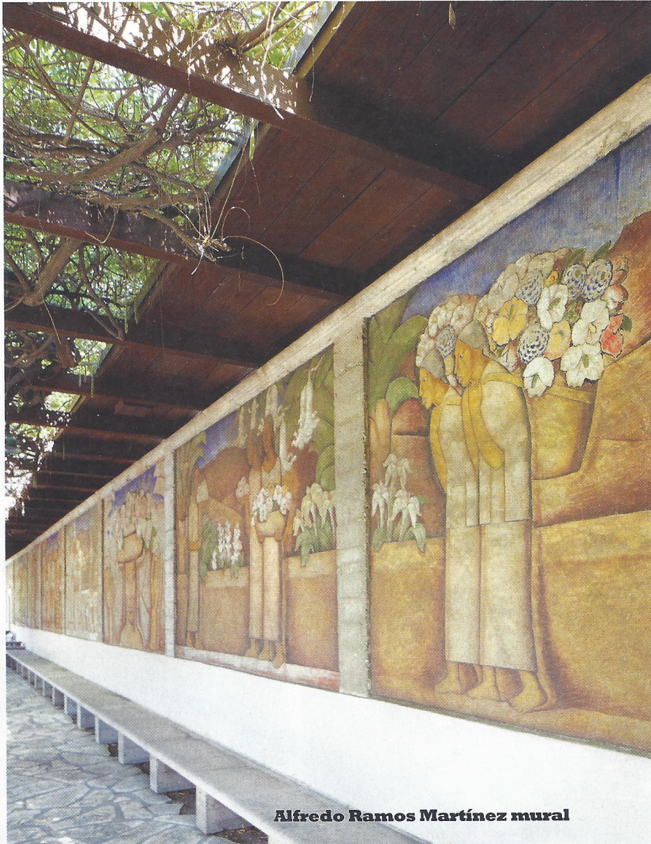
Alfredo Ramos Martínez mural

Appealing to our inner computer geek is Claremont Graduate University's Paul Gray PC Museum , a repository of archaic computers from 1971 to the present. cgu.edu/pages/2057.asp . View art collections and temporary exhibitions at the Pomona College Museum of Art ( pomona.edu/museum ), the Ruth Chandler Williamson Gallery ( rcwg.scrippscollege.edu ), Clark Humanities Museum ( www.scrippscollege.edu/events/clark ), and Pitzer Art Galleries ( pitzer.edu/galleries ). Dance enthusiasts can catch student performances by the Claremont Ballroom Dance Company held periodically at the Smith Campus Center. fb.com/claremontballroom .